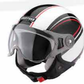
MODEL G103 CODE BR WHITE