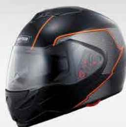
MODEL G1818 CODE ST-BLACK ORANGE