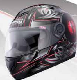
MODEL G2002 CODE BLACK-RED EYE