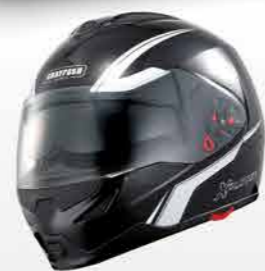
MODEL G1818 CODE XP-BLACK SILVER