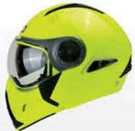
MODEL G3000 CODE NEON YELLOW