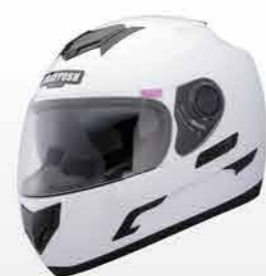
MODEL G2002 CODE SOLID - WHITE