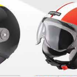
MODEL G103 CODE MATT RED-WHITE