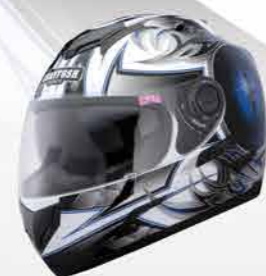
MODEL G2002 CODE WHITE-BLUE EYE