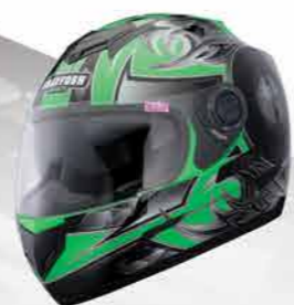
MODEL G2002 CODE GREEN-SILVER EYE