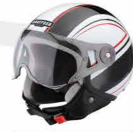
MODEL G103 CODE BR BLACK