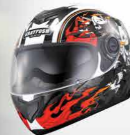
MODEL CODE G2002 NOH