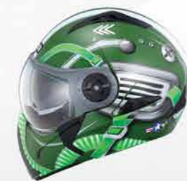
MODEL G3000 CODE AVIATOR GREEN