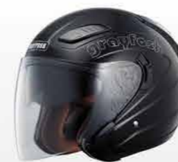
MODEL G505DV CODE BLACK