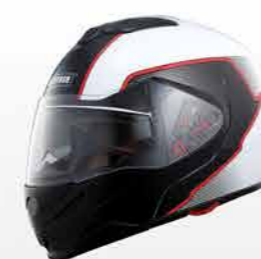
MODEL G1818 CODE ST-WHITE RED