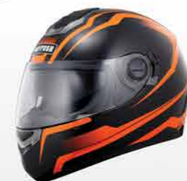
MODEL G2500 CODE SI-BLACK/ORANGE