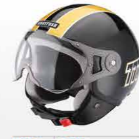
MODEL G103 CODE TS BLACK