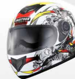
MODEL CODE G2002 LD - WHITE