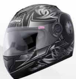
MODEL G2002 CODE MATT BLACK-SILVER EYE