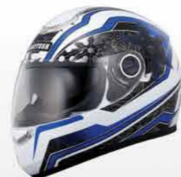
MODEL G2500 CODE SAM-WHITE/BLUE