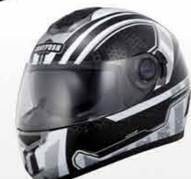
MODEL G2500 CODE STUNT - BLACK