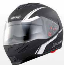
MODEL G1818 CODE XP-MATT BLACK SILVER