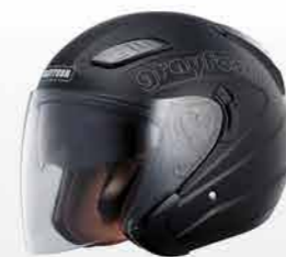
MODEL G505DV CODE MATT BLACK