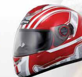
MODEL G2500 CODE STUNT - RED