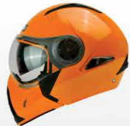
MODEL G3000 CODE NEON ORANGE