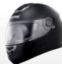
MODEL G2500 CODE BLACK