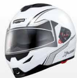
MODEL G1818 CODE XP-WHITE SILVER