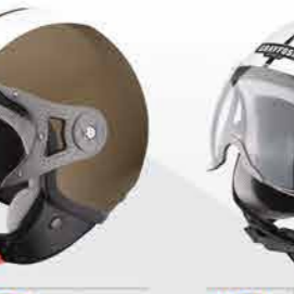
MODEL G103 CODE MATT GRAY-WHITE