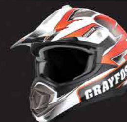
MODEL CODE G8500 MX - RED