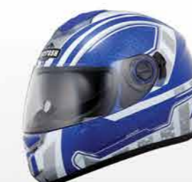
MODEL G2500 CODE STUNT - BLUE