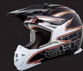
MODEL CODE G1005 BLACK/WHITE/ORANGE