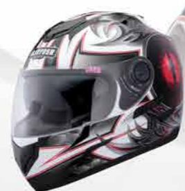
MODEL G2002 CODE WHITE-RED EYE