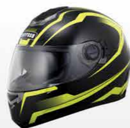
MODEL G2500 CODE SI-BLACK/YELLOW