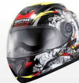
MODEL CODE G2002 LD - BLACK