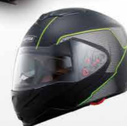
MODEL G1818 CODE ST-MATT BLACK GREEN