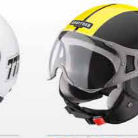
MODEL G103 CODE MATT BLACK-YELLOW