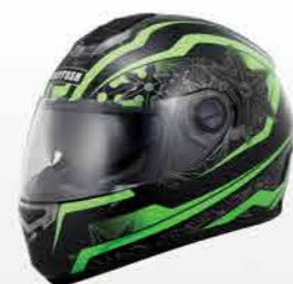
MODEL G2500 CODE SAM-BLACK/GREEN