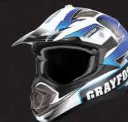
MODEL CODE G8500 MX - BLUE