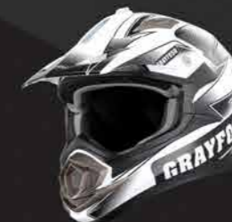
MODEL CODE G8500 MX - BLACK