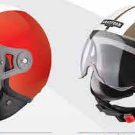
MODEL G103 CODE MATT BROWN-WHITE