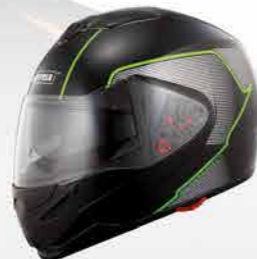
MODEL G1818 CODE ST-BLACK GREEN