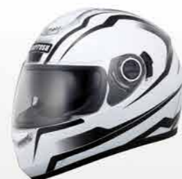
MODEL G2500 CODE SI-WHITE/BLACK