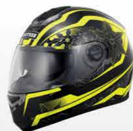
MODEL G2500 CODE SAM-BLACK/YELLOW