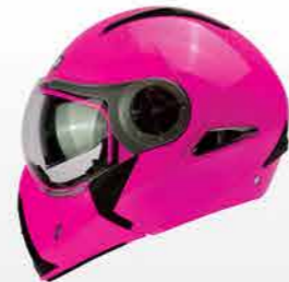
MODEL G3000 CODE NEON PINK