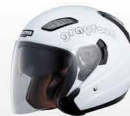
MODEL G505DV CODE WHITE