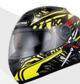
MODEL CODE G2002 ROCKSTAR-YELLOW