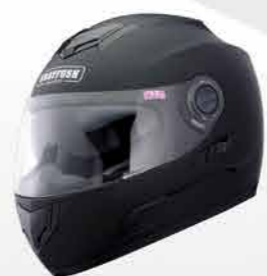
MODEL G2002 CODE SOLID-MATT BLACK