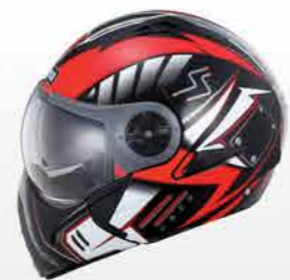
MODEL G3000 CODE ZONDA RED