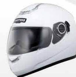
MODEL G2500 CODE WHITE