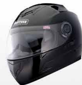
MODEL G2002 CODE SOLID - BLACK