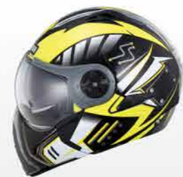
MODEL G3000 CODE ZONDA YELLOW