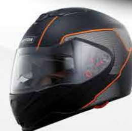
MODEL G1818 CODE ST-MATT BLACK ORANGE