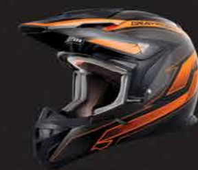
MODEL CODE G1005 BLACK/GRAY/ORANGE