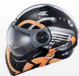
MODEL G3000 CODE AVIATOR BLACK