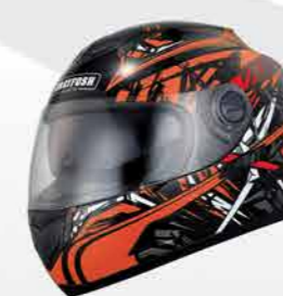
MODEL CODE G2002 ROCKSTAR-ORANGE