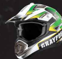
MODEL CODE G8500 MX - GREEN