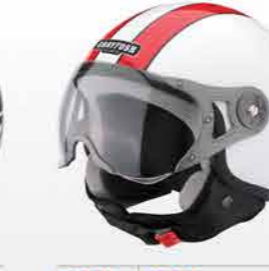
MODEL G103 CODE TS WHITE